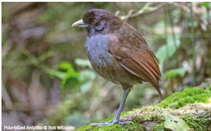
Pale-billed Antpitta

This National Protected Area contains a mountain range that forms the extreme northern part of the eastern Andes. Much of the humid forests here has been cleared along the road but there are a few remaining areas with some very special birds. Huembo , a roadside visitor centre administered by the NGO EcoAn, is one of the best places to see the Marvellous Spatuletail, which visits feeders. The grounds also attract Little Woodstar, Rufous-capped