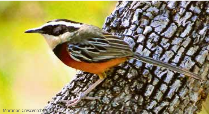
Marañon Crescentchest

The Marañon River Valley bisects the Andes in northern Peru and is dominated by drier forests, with high numbers of cacti. A suite of endemic species have evolved in this isolated area of dry forest, most of which can be found around the town of Jaen. Two private protected areas near town, Gotas de Agua and Bosque de Yanahuanca , both give access to trail networks and local guides are available. The birds are similar with: Tataupa tinamou, Peruvian Pigeon, the leucogaster subspecies of Northern Slaty Antshrike, Marañon Crescentchest, Marañon Spinetail, Necklaced Spinetail, the sclateri subspecies of Speckle-breasted Wren, the maior subspecies of Tropical Gnatcatcher, Red-crested Finch and Little Inca-Finch. Further north Tamborapa / Camino La Coipa is a public-access alternative site with similar species.