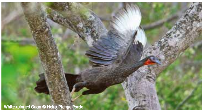
White-winged Guan

The traditional starting point for the Northern Peru Birding Route. The cold off-shore waters teem with marine life and create the arid onshore conditions. The inland forests here are the southern limit of the Tumbesian region and home to several of its rarest endemics. Puerto Eten wetlands south of the mouth of the Chancay river. Increasingly degraded and drained but still holds good birds: Chilean Flamingo, White-tufted Grebe, Many-coloured Rush-Tyrant, Plumbeous Rail, Least Bittern. Beach and off-shore is good for seabirds and gulls: Inca Tern, Peruvian Booby, Peruvian Pelican, Peruvian Tern, Grey Gull, Belcher's Gull. Nearby fields and dunes (including those south of the village of Santa Rosa ) can be good for Tawny-throated Dotterel, Least Seedsnipe and Coastal Miner. Chaparri Ecological Reserve is a private protected area managed by community owners. In this reserve, local people preserve 34,412 ha of semi-desert and gallery woodland. Following reintroduction, the reserve is now home to a population of approximately 100 White-winged Guans and also one of the best places to see Sulphur-throated Finch, amongst a variety of Tumbesian species including Tumbes Hummingbird, Short-tailed Woodstar, Collared Antshrike, Elegant Crescentchest, Tumbes Tyrant, Baird's Flycatcher, White-tailed Jay, White-headed Brush-Finch, Tumbes Sparrow. Accommodation is available in the reserve and local community and community guides must be used. Tinajones Reservoir is a reliable site for