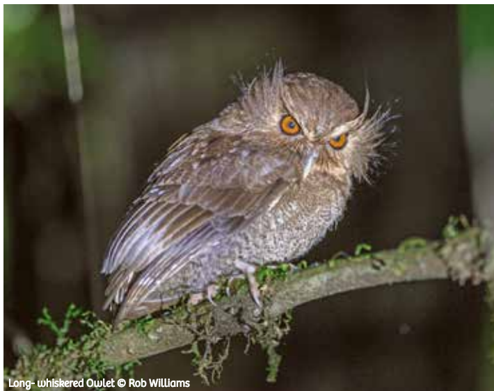
Long-whiskered Owlet

and Yellow-scarfed Tanager, White-capped Tanager. Garcia Ridges , a series of small ridges with stunted forest and cliffs is the best area to find the Royal Sunangel which can usually be found along the road feeding at flowering shrubs. A side trail here passes through land owned by EcoAn and access should be arranged at Owlet Lodge. The area is very good for tanager flocks. The area around Alto Nieva has stunted forest and is particularly good for Bar-winged Wood-wren, and Cinnamon-breasted Tody-Tyrant. A private reserve, Fundo Alto Nieva , offers a good chance for these and also has hummingbird feeders and trails. The staff can guide visitors to see