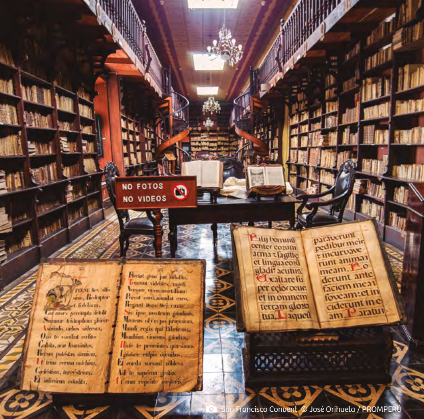
San Francisco Convent.