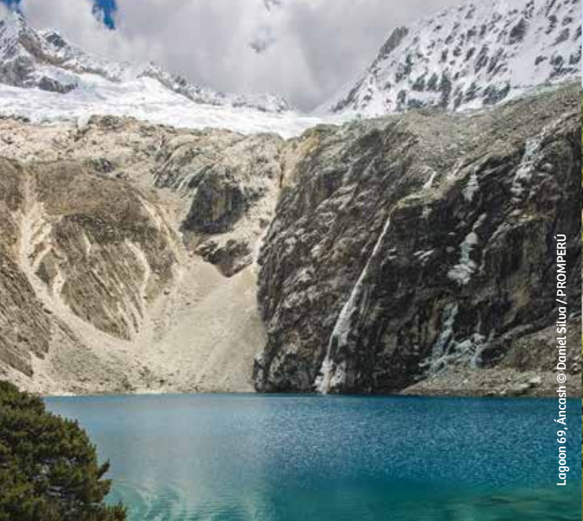
Lagoon 69, Áncash