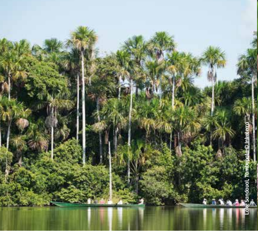
Lake Sandoual, Tambopata