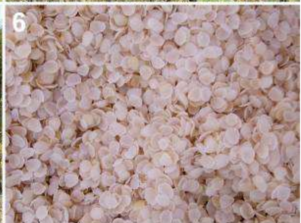
1) Harvested tara fruit, 2) Tara fruit hanging on the plant, 3) Flowers, 4) Habit, 5) Habitat (spiny thickets) in Ayacucho, 6) Leaflets.